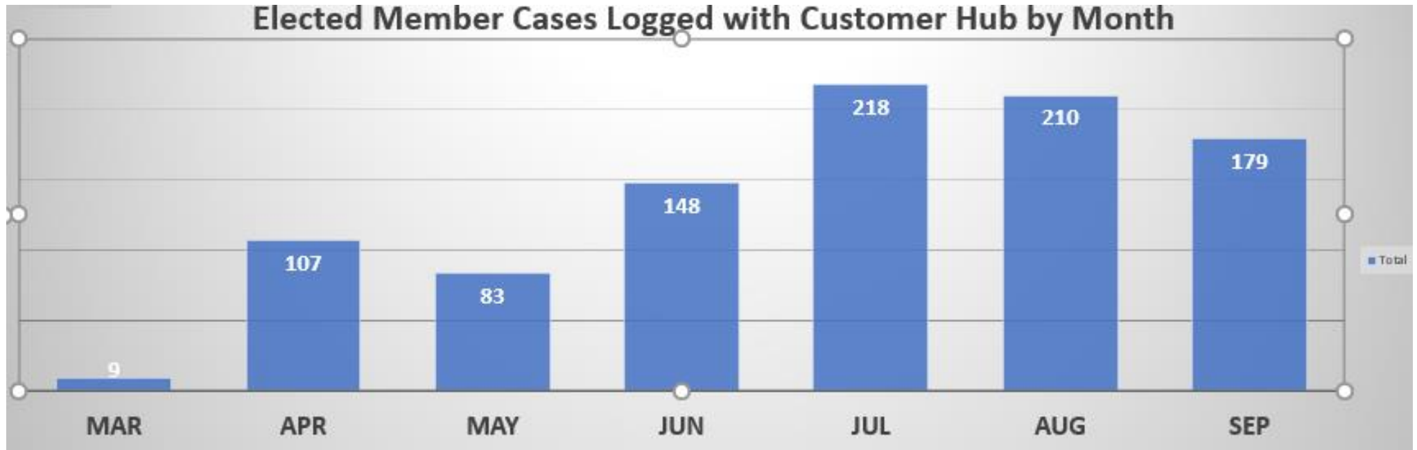
Elected Member Cases Logged with Customer Hub by Month